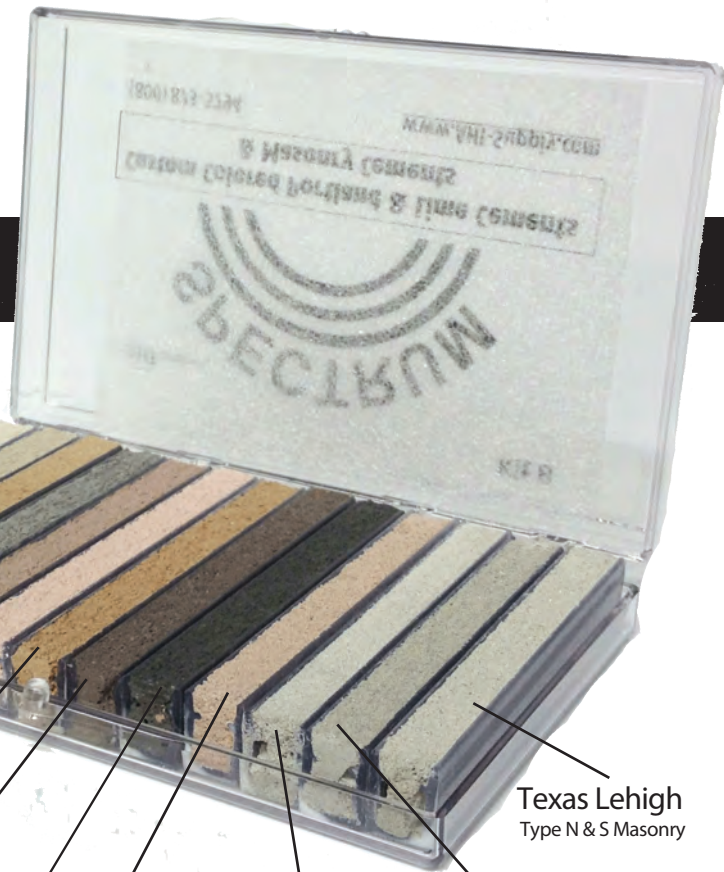
Spectrum Hill Country Buff Portland & Lime -Type S Spectrum Light Beige Type N Masonry Spectrum Ivory Type S Masonry

These are basically the same color, only different types.